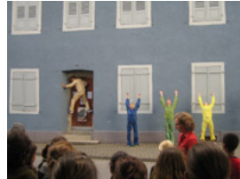
... and in front of the Blue House