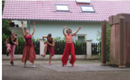
Dance performance at the former location of the synagogue...