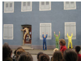
... and in front of the Blue House