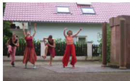
Dance performance at the former location of the synagogue...